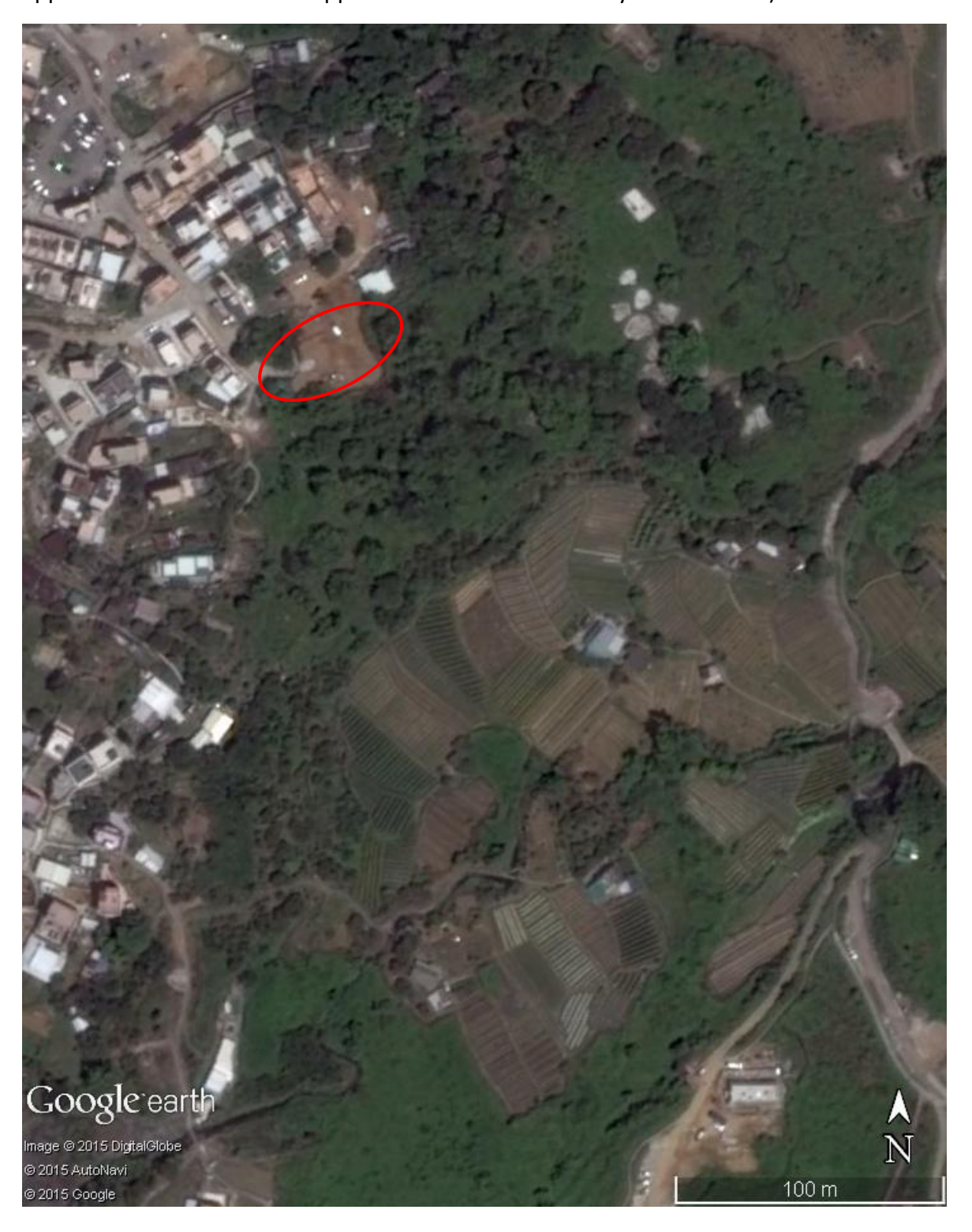
Figure 1. Google Earth aerial photograph of the active agricultural lands in the Lam Tsuen San Tsuen area and its surroundings (photograph taken on 14 April 2015) (the approximate location of the application sites is indicated by the red circle).