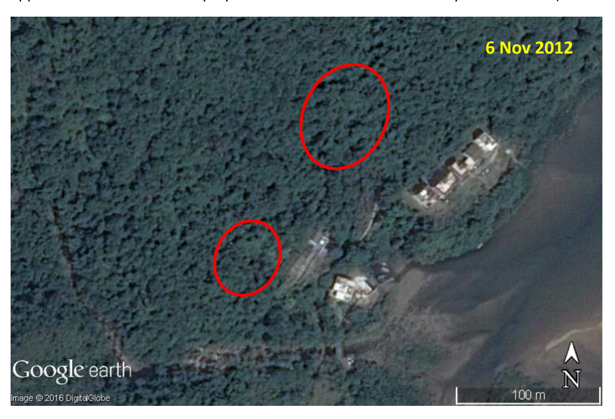
Figure 1. Google Earth aerial photographs showing the landscape changes in Tai Tan (the approximate locations of the proposed small houses are indicated by the red circles).