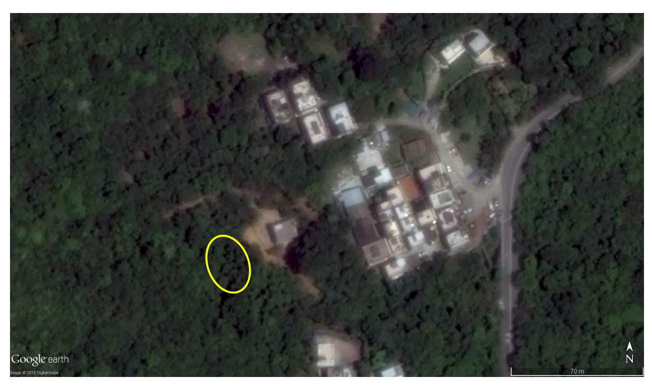
Figure 1. Google Earth aerial photographs showing the densely vegetated condition at and around the applications sites in Ko Tong (the approximate location of the application sites is indicated by the yellow circle). Photograph taken on 14 April 2015.