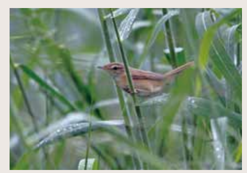
Manchurian Reed Warbler, a potential beneficiary of the reedbed restoration work.

Inside the gei wai, two large stands of reedbed closest to the Education Centre have succumbed to the inevitable process of succession, evident by the presence of small mangroves and terrestrial grasses. Commencing in April, vegetation will be cut and removed by hand, then a dozer and backhoe will be used to remove silt. The aim is to lower the gei wai floor by around 15 cm, then let reed grass naturally regenerate from the remaining rhizomes.