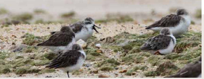
Spoon-billed Sandpiper found roosting in a fishpond in Beihai