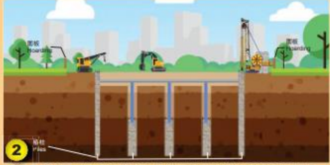
安裝支撑地下空間發展的樁柱及進行地面挖掘以安裝頂層樓板 Install piles for supporting the underground space development and carry out surface excavation for construction of top slab