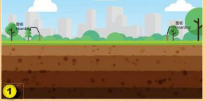
建造工程開始前,先整理工地現場及以圍板圍封工地 Tidy up and fence off the site by hoarding before commencement of construction