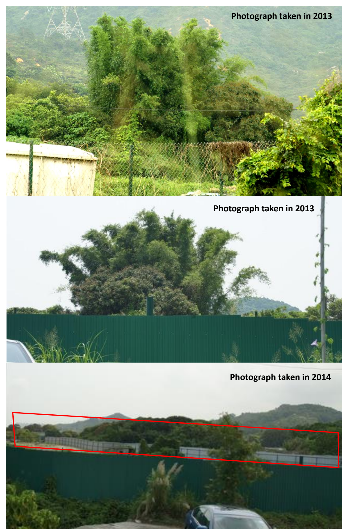
Figure 1. The conditions of the Ngau Hom Sha egretry before and after the destruction. Note that the absence of bamboo cluster in the photograph taken 2014 indicated by the red box.