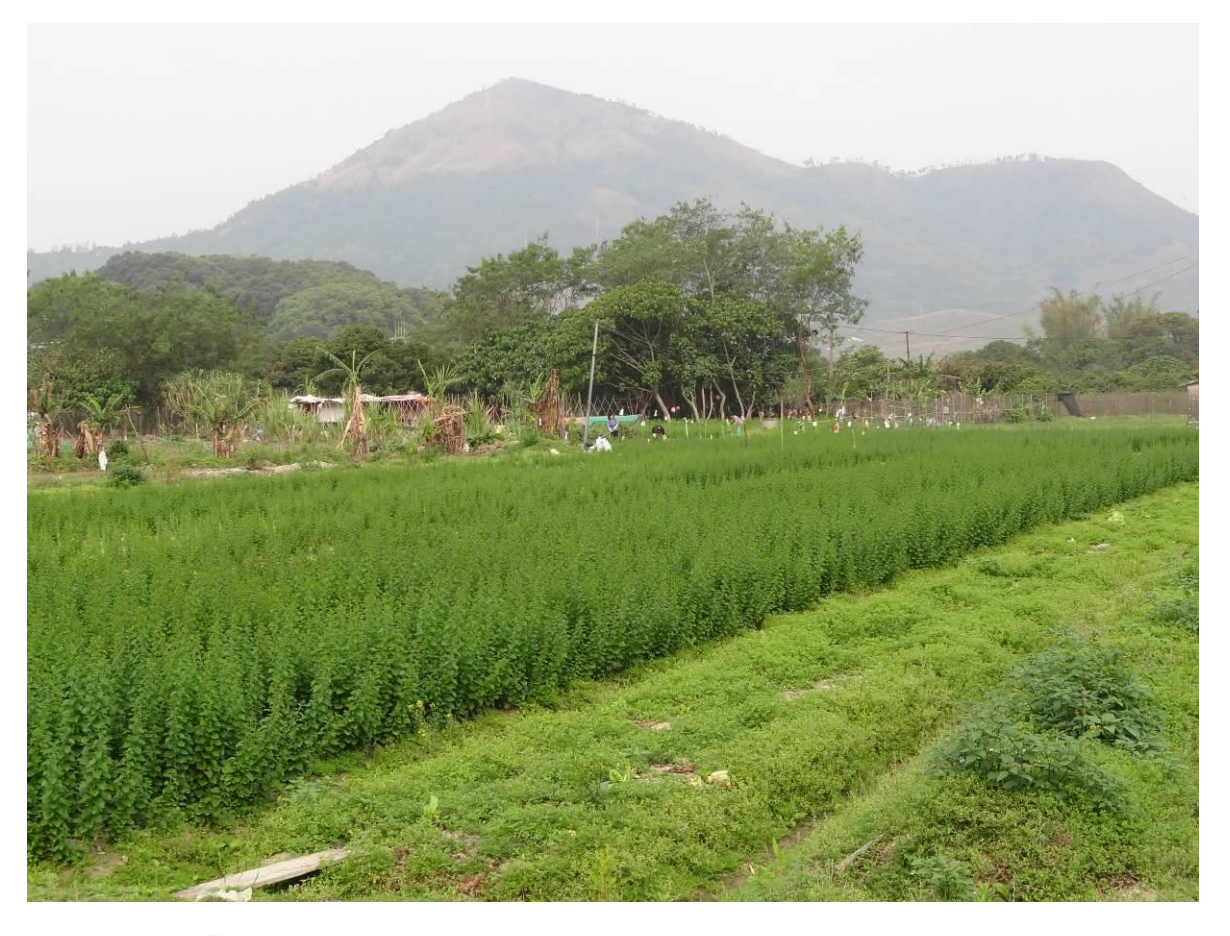
Figure 1. Wet and dry agriculture lands in the Tsiu Keng area.