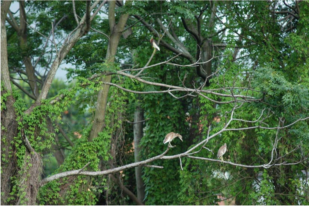
Chinese Pond Heron at Tam Kon Chau