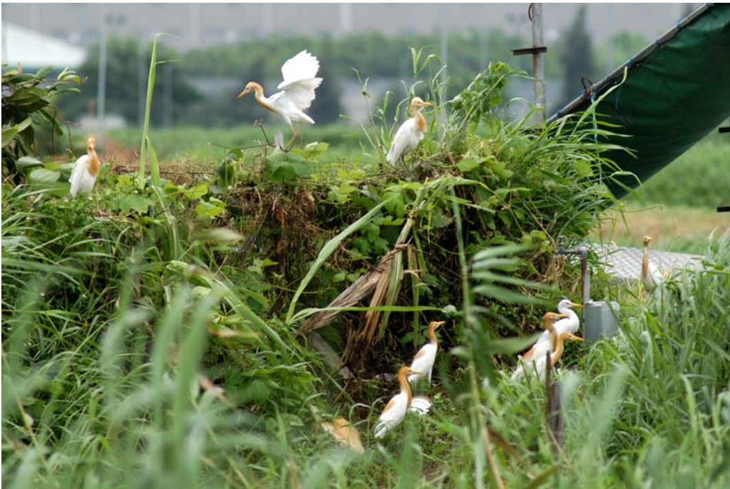
Cattle Egret in breeding plumage (by Henry Lui)