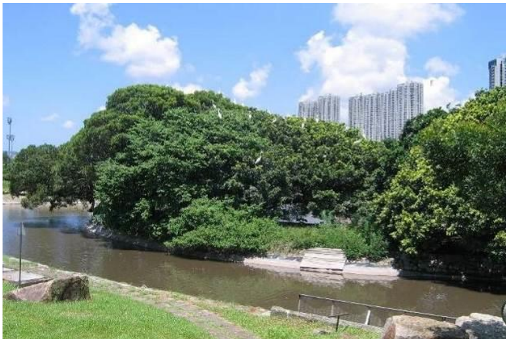
Penfold Park Egrettry.

The trends in flagship and umbrella species should continue to be monitored. Potential resources to monitor species where data gaps exist should be explored, especially for taxa where no data is available.