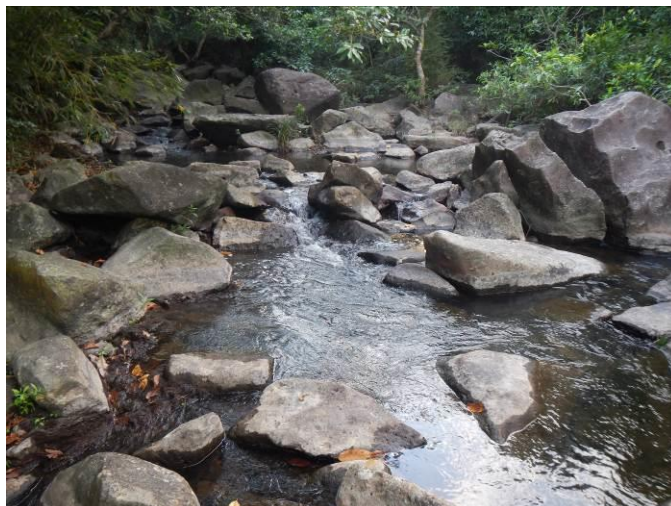
Lowland natural streams are becoming increasingly rare.