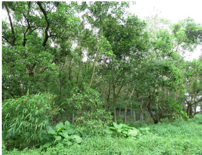
Green Belt Land at Tung Tsz Road, Tai Po, to be rezoned as residential use.