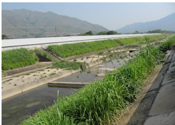
Channelized rivers commonly found in New Territories.