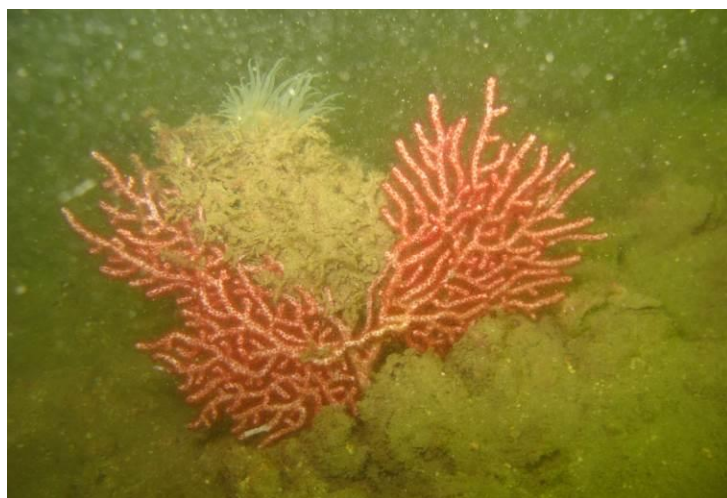
The status of Gorgonian corals in Hong Kong has not been studied.