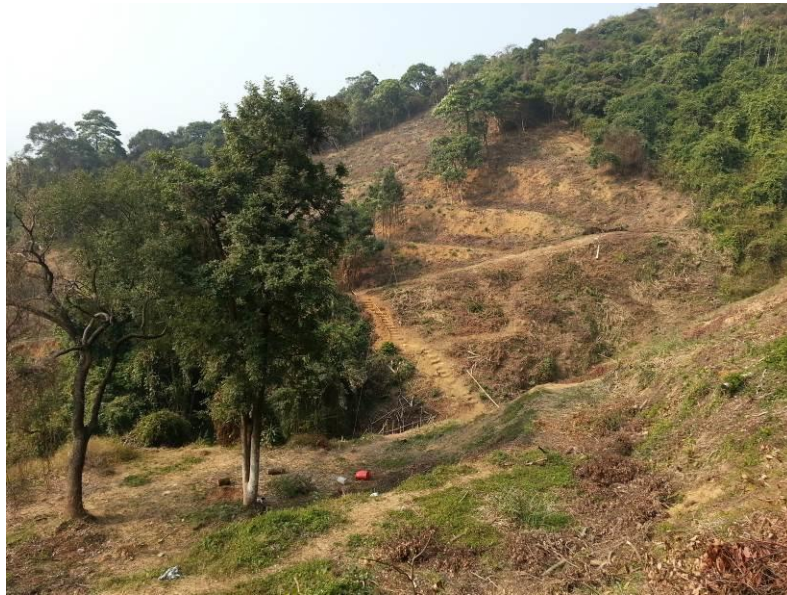
Vegetation clearance is common on Green Belt land close to Tai Po where potential residential developments are proposed.