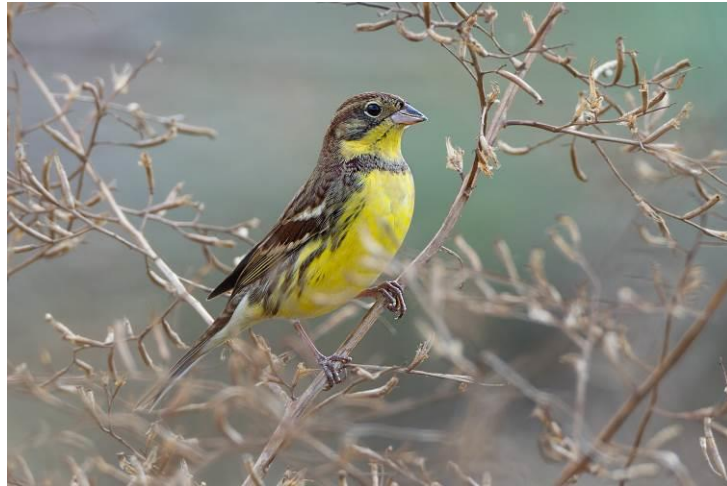
Yellow-breasted Bunting was uplisted in 2013 to “Endangered” by IUCN.