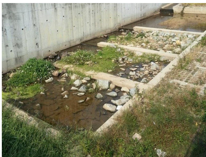
Kau Lung Hang stream where revitalization by DSD has taken place.