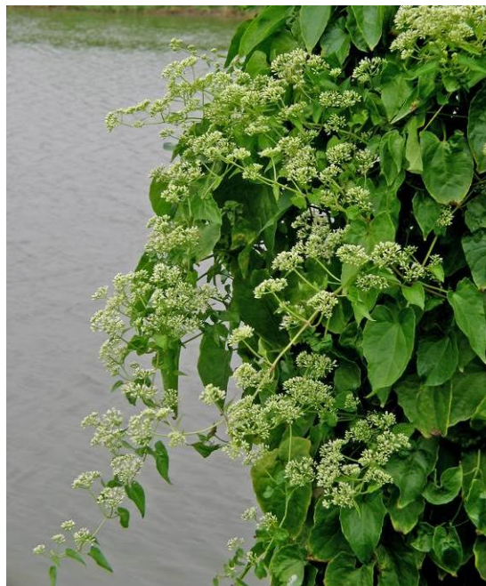
Mikania climbs up other plants and eventually covers them, blocking light for photosynthesis and smothering them.