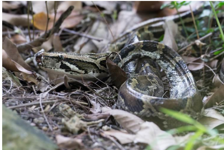
Burmese Python was uplisted in 2012 to “Vulnerable” by IUCN.