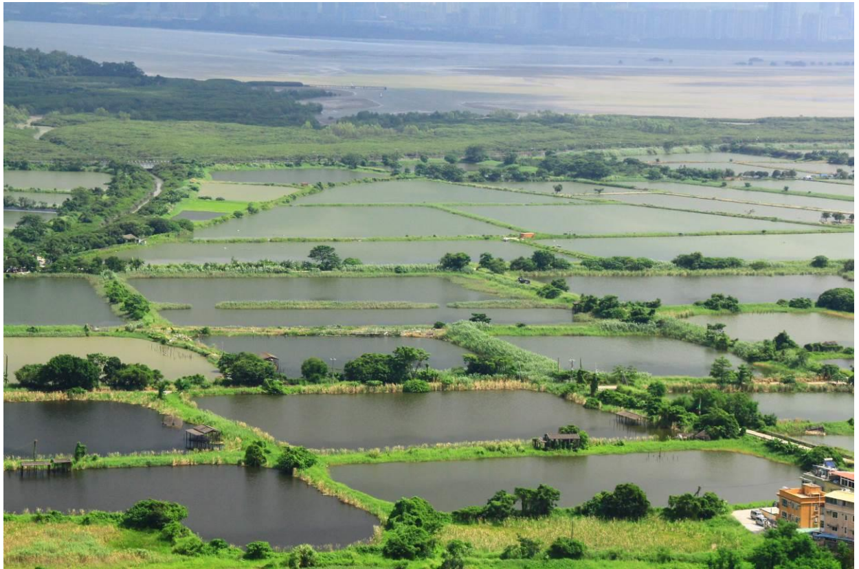
HKBWS currently manages over 600 hectares of fishponds in Deep Bay under a Management Agreement. Funding is provided by the Environment and Conservation Fund.

To protect the integrity of Country Parks, designation of enclaves as part of their surrounding Country Parks should continue. Marine habitats should be protected based on ecosystem function and ecological value rather than a compensation measure for reclamation works.