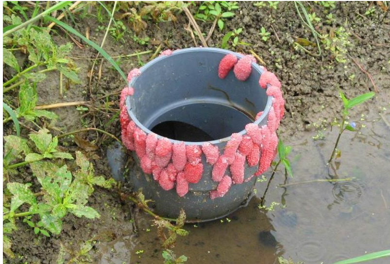
Apple snail is a predator of native freshwater snails and lotus plants in Hong Kong and is commonly seen in freshwater wetlands.

Systematic invasive species monitoring and removal programmes supported by AFCD in collaboration with other Government departments and other relevant organizations could effectively reduce the colonisation rate and impacts of alien invasive species on local biodiversity.